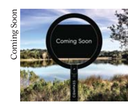
Downtown Lafayette Charmer 3 Bed | 2 Bath | 1,968 Sq Ft | 0.31 Acre

Let's Make a Plan for Your Next Big Move! Work With Us! 925.788.8345