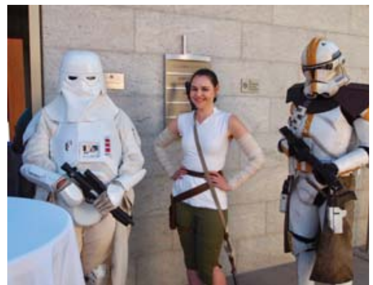
Some traveled from other galaxies to attend.